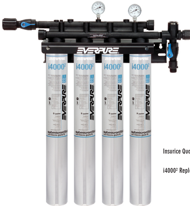
Insurice Quad-i4000 2 System: EV9325-04

Delivers premium quality water for ice applications