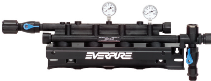
QC71 Quad Parallel Head: EV9336-11

Engineered for durability, strength and longevity. Will not corrode