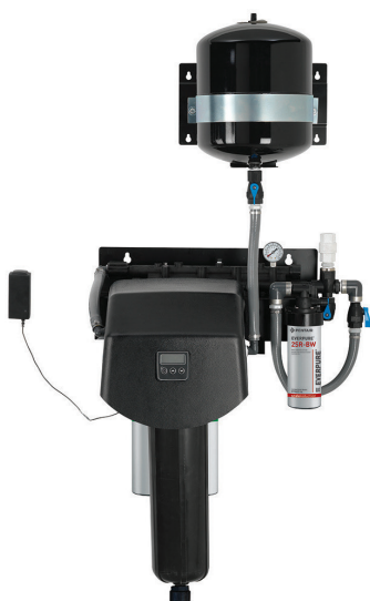
Endurance High Flow Twin: EV9437-40

ALL THE BENEFITS OF THE ENDURANCE PLATFORM PLUS SELF-CLEANING, ULTRAFILTER MEMBRANE-BASED PRETREATMENT