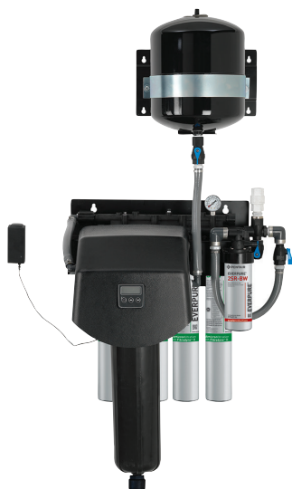
Endurance High Flow Quad: EV9437-42

ALL THE BENEFITS OF THE ENDURANCE PLATFORM PLUS SELF-CLEANING, ULTRAFILTER MEMBRANE-BASED PRETREATMENT