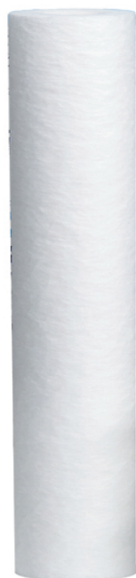
EC110 Prefilter Cartridge: EV9534-12