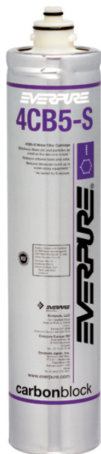
4CB5-S Replacement Cartridge: EV9617-21

Delivers quality water for foodservice, vending and OCS applications