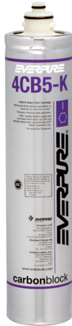
4CB5-K Replacement Cartridge: EV9617-36

Delivers quality water for foodservice, vending and OCS applications