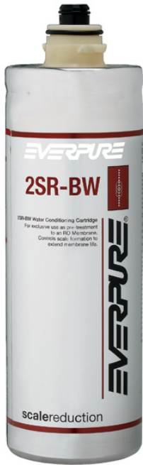
2SR-BW Cartridge: EV9627-14

Controls Scale Formation in RO Applications