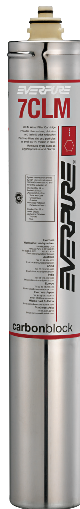
7CLM Replacement Cartridge: EV9693-01 1 PK

NSF Certified under NSF/ANSI Standards 42 and 53.