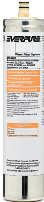
EFS8002 Replacement Cartridge: EV9781-10

Replacement filter for Cuno® Series 8000 systems