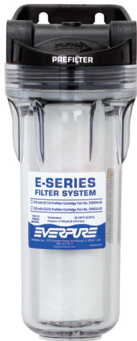
E-10 Prefilter System: EV9795-80

Prefilter System for foodservice applications