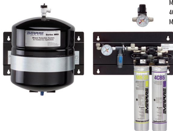
MRS-20T System: EV9797-92 4CB5 cartridge: EV9617-17 MR-20 Cartridge: EV9273-69