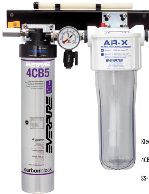
Kleensteam CT System: EV9797-50

Total water treatment system for steam applications