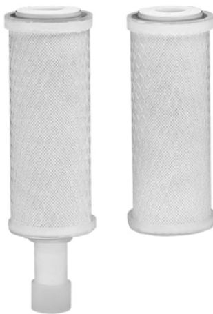
CWS-10 Carbon Block Filter Wrap: EV9799-06

Adds sediment and carbon filtration capabilities to Wrap ScaleStick®, which provides scale and corrosion control