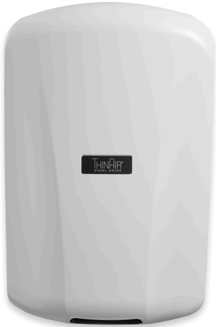
TA-ABS White Polymer (ABS) With SanaFor™ Antimicrobial Additive