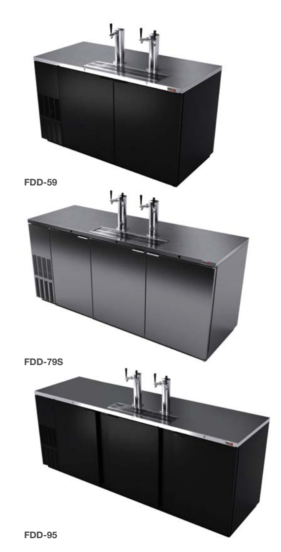
Item # -