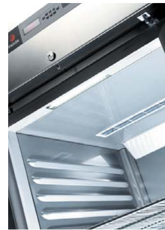
Embossed 304 S/S shown