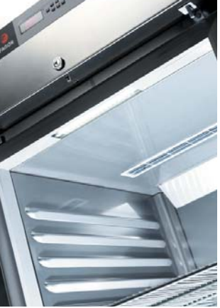
Embossed 304 S/S shown