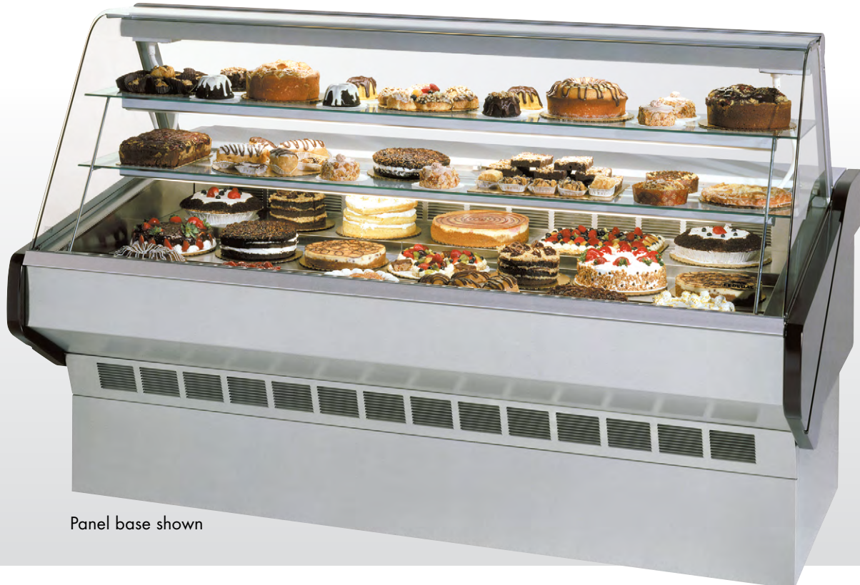
Panel base shown

Market Bakery. The low profile merchandiser that provides solutions to your merchandising needs. Cases are available in lengths of 3', 4', 5', 6', and 8'. Designed for continuous case line-ups without middle end glass.