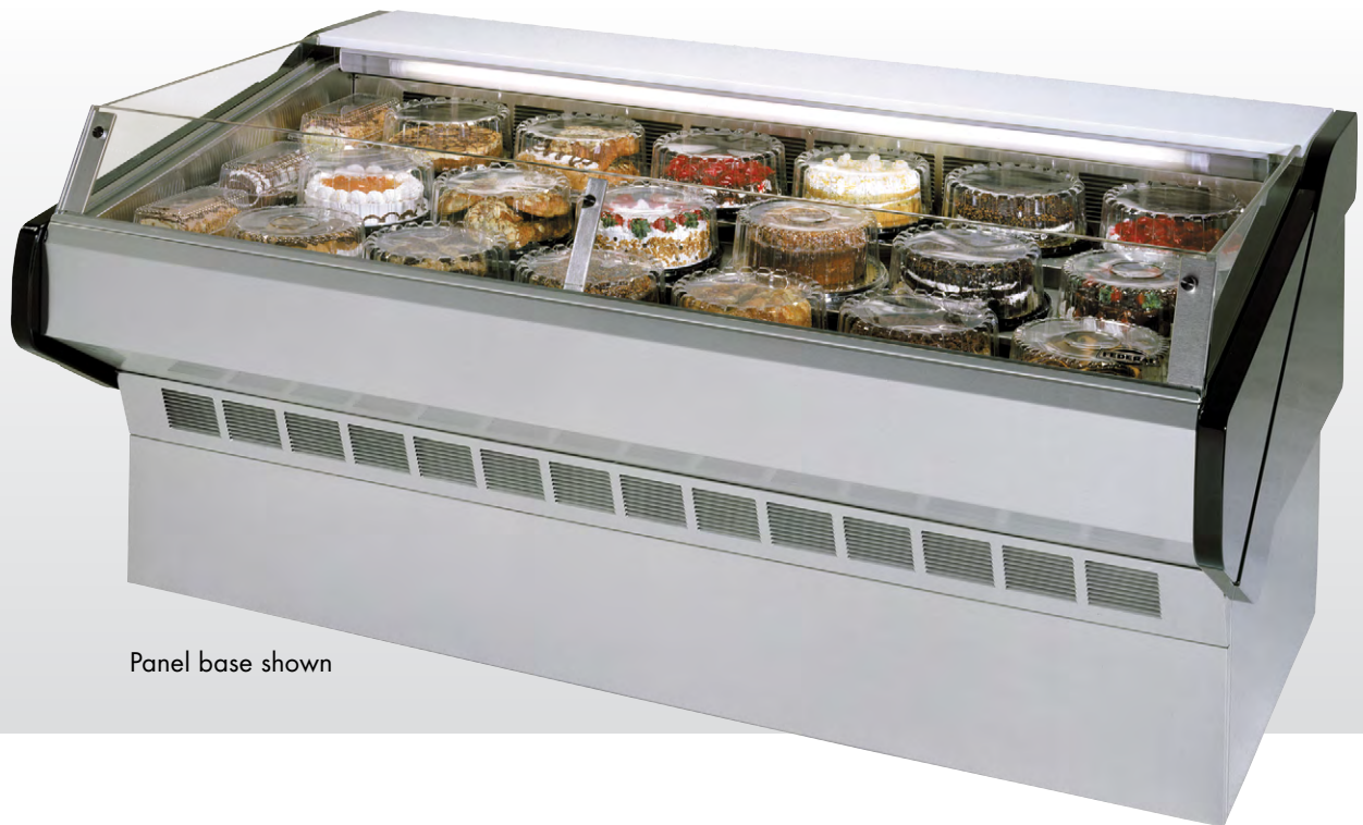
Panel base shown

Market Bakery. The merchandiser that provides solutions to your merchandising needs. Cases are available in lengths of 3', 4', 5', 6', and 8'. Designed for continuous case line-ups.