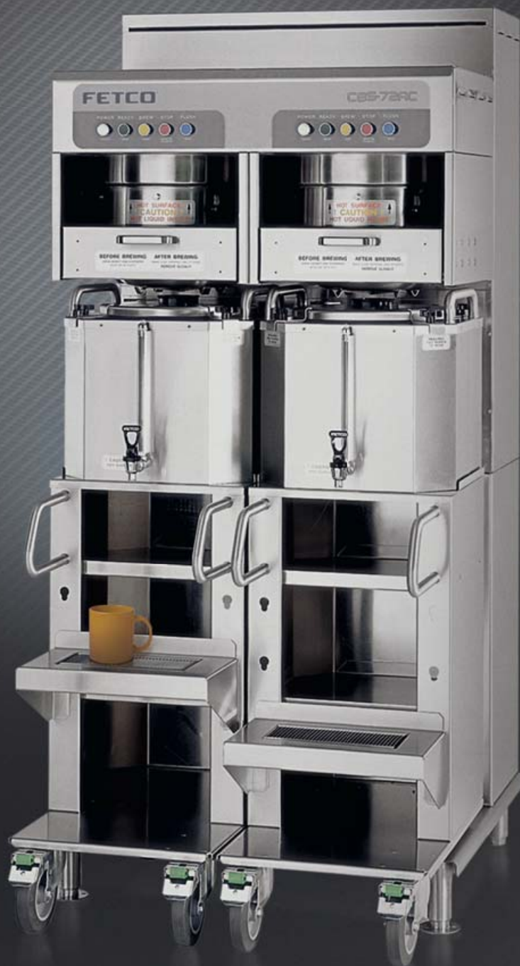
Shown with 6.0 Gallon Mobile LUXUS® Thermal Dispenser (LBD-6C) and Serving Station for LBD-6 with Drip Tray

FETCO® is the category expert and the ONLY manufacturer of ultra high-volume (7-24 Gallon) portable coffee brewing systems for very large scale operations. Due to the high capacity output and reliable performance the CBS-7000 Series is the preferred choice for specification in hotels, stadiums, convention centers and other large venues.