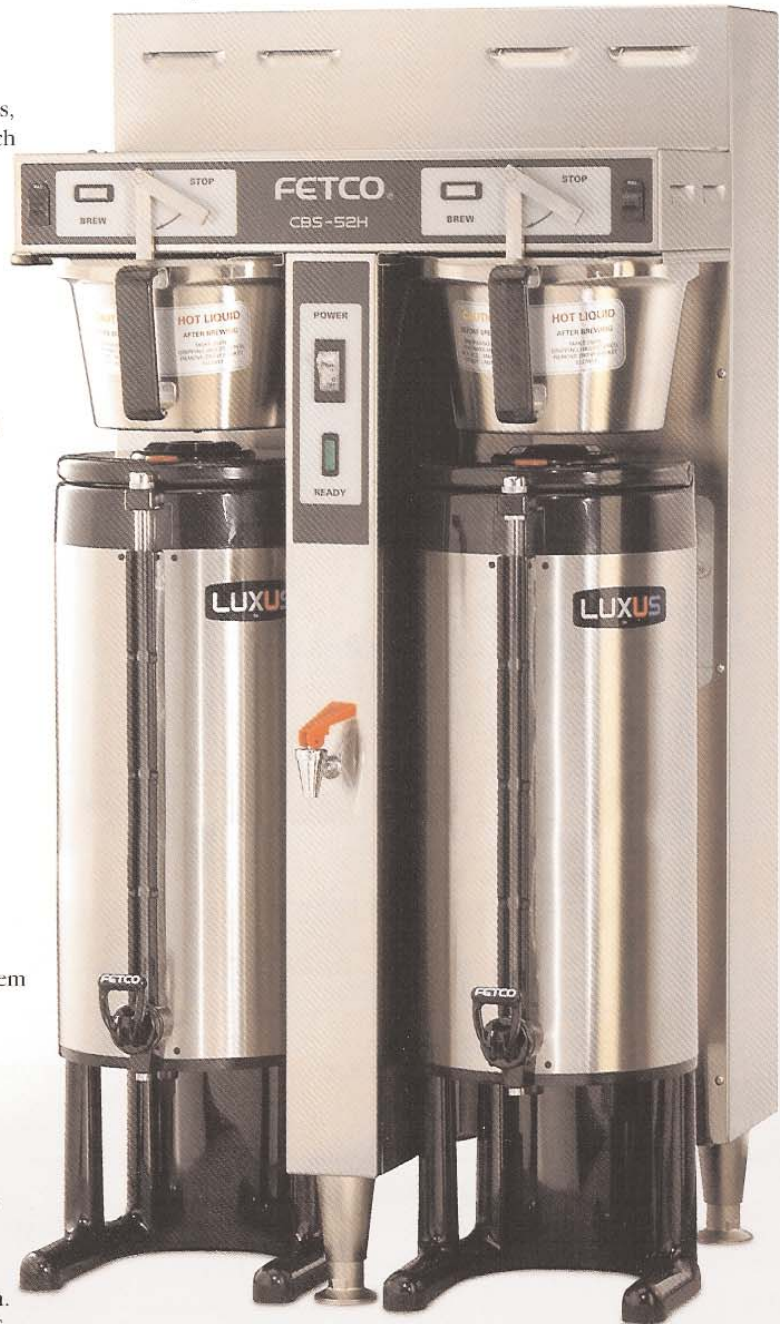
CBS-52H20 in Stainless Steel finish and with 2.0 Gallon LUXUS Dispensers

You can prepare them ahead of time and place them where you want them. It is important to note that the LUXUS thermal dispenser can be staff-operated or used as a self-service system