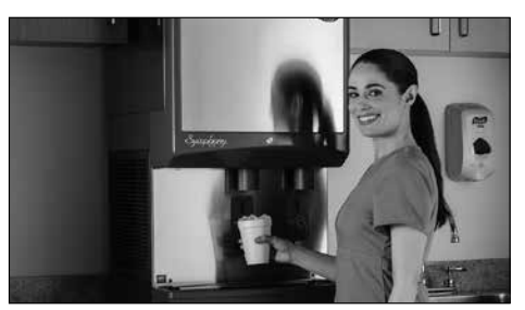
SensorSAFE not recommended for use with clear containers or for applications in direct sunlight