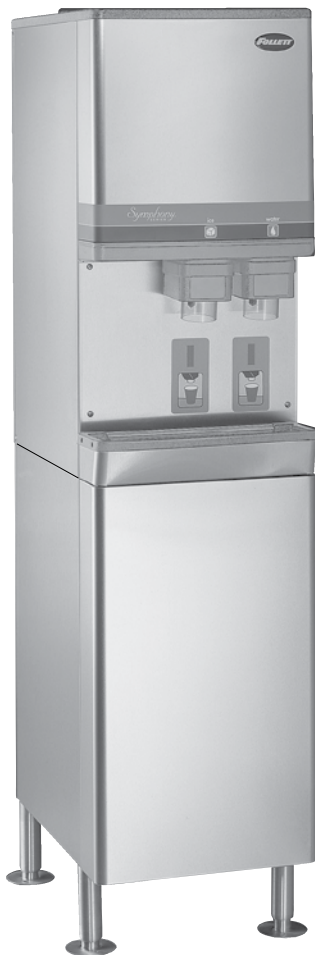
Stainless steel base stand accessory shown with 12CI400A ice dispenser (not included) transforms Follett countertop dispenser into freestanding unit

26"W x 29"D x 33"H (661 mm x 737 mm x 838 mm) For use with 110CT400A/W ice dispensers.