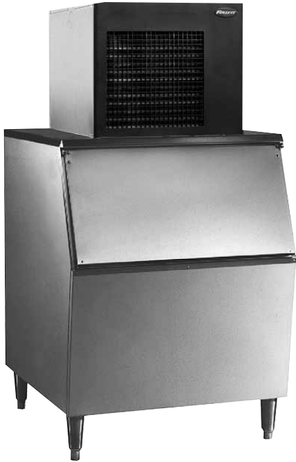
Model MFD400ABT flake icemaker (shown on Follett 425-30 ice storage bin, ordered separately)