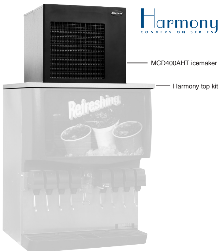
Model MCD400AHT on countertop ice and beverage dispenser, supplied by others