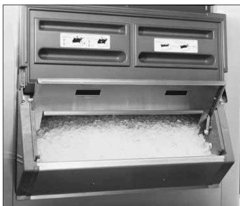
Industry exclusive SmartGATE ice shield

Additional carts and accessories (refer to form# 3435)