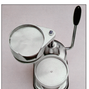
Model BT 13