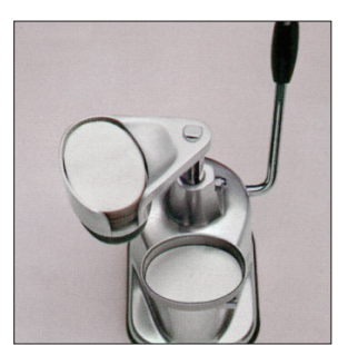
Model B0 10