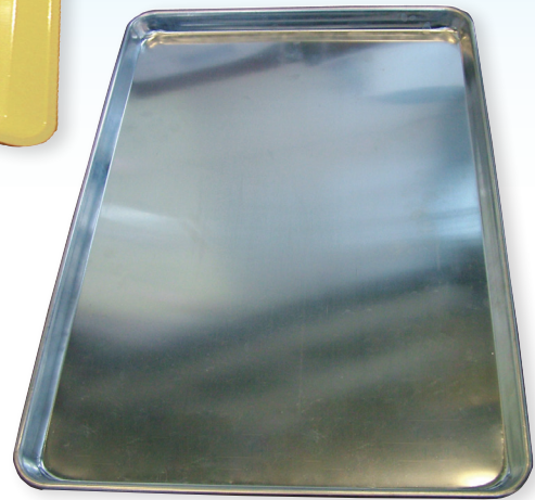
Aluminum Bun Pan