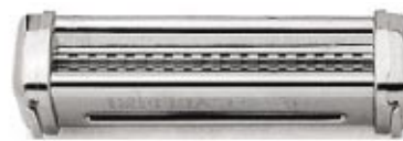
PCRM 2205 12mm - 7/16"