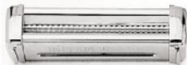
PCRM 2204 6.5mm - 1/4"