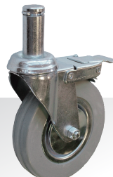
5" Industrial Caster With Brakes