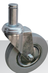
5" Industrial Caster Without Brakes