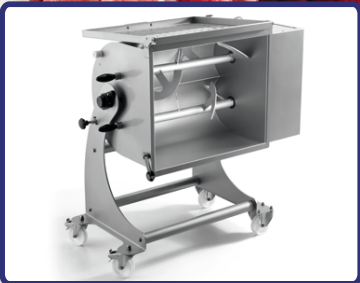
Removable Mixing Arms