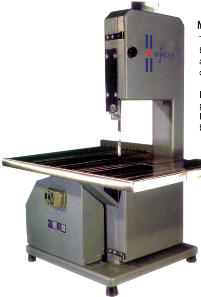
TABLE TOP BANDSAWS