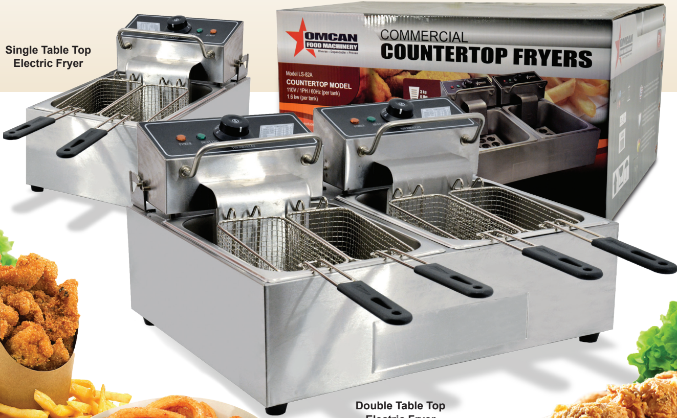
Double Table Top Electric Fryer