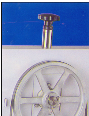
Blade Tension Regulator