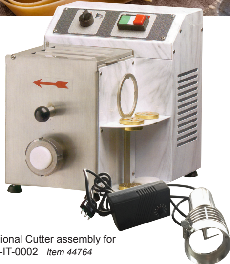
Optional Cutter assembly for PM-IT-0002 Item 44764