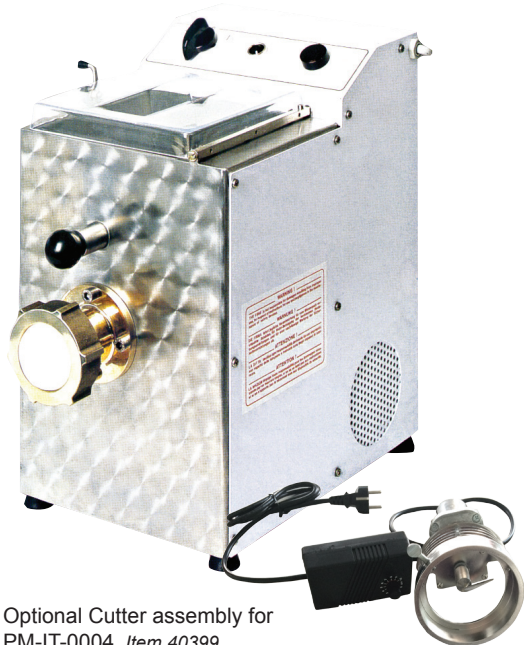
Optional Cutter assembly for PM-IT-0004 Item 40399