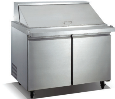
SCLM-2 / SCLM2-60

The SCL series of prep refrigerators provides ample storage space and a 3/4" cutting board / work area. Constructed of stainless steel and features self-closing doors.