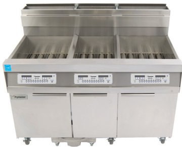
Model Shown: 11814/HD50G/11814