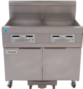
Model Shown: 21814 with optional filtration