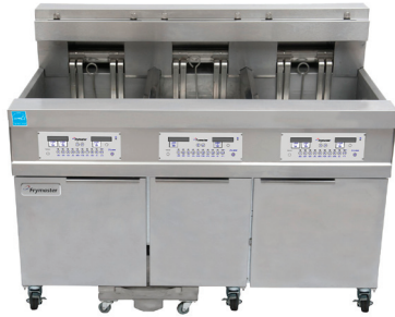
Model Shown: 11814E/RE17/11814E