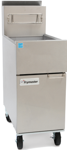
ESG35T Shown with optional casters.