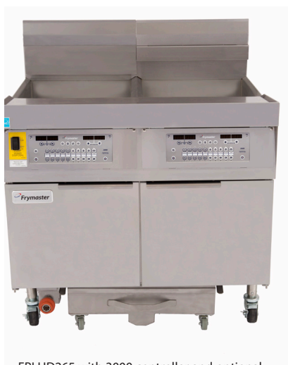
FPLHD265 with 3000 controller and optional marine edge and front oil disposal.