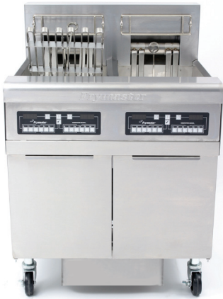
FPPH217CSC Shown with optional CM3.5 controllers

*Includes spreader cabinet. Adding a spreader cabinet to any model, changes it from FPP to FMP.