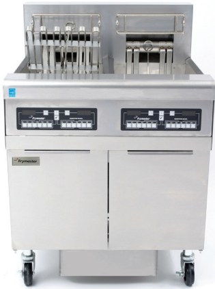
FPPH217CSC Shown with optional CM3.5 controllers

*Includes spreader cabinet. Adding a spreader cabinet to any model, changes it from FPP to FMP.