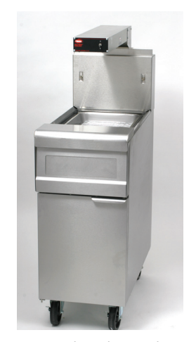
Spreader Cabinet with optional Food Warmer, holding station with cafeteria pan and casters. .