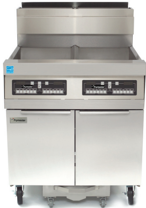
HD250 Shown with optional filtration and CM3.5 controller