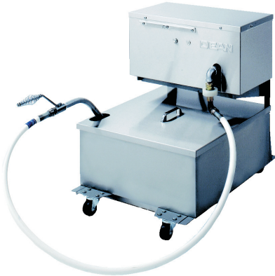
MF90AU/80 Micro-Flo Portable Oil Filter