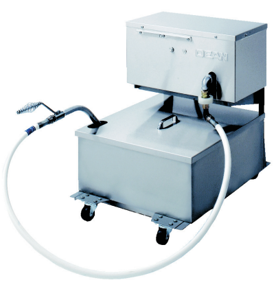
MF90AU/80 Micro-Flo Portable Oil Filter