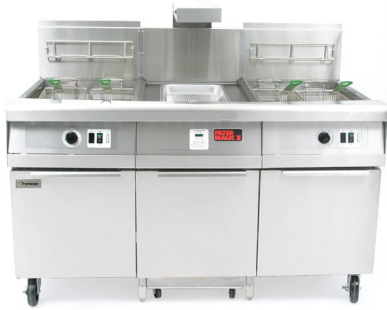
FM2CFESC Shown with optional holding station, heat lamp, and cafeteria pan

*Up to four fryers maximum each side of Filter Magic System.