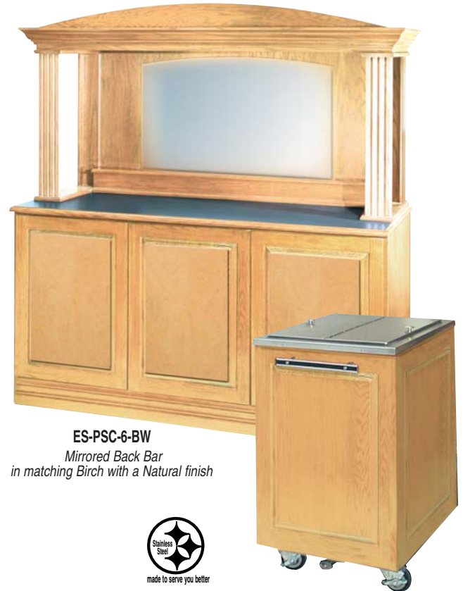
ES-PSC-6-BW Mirrored Back Bar in matching Birch with a Natural finish