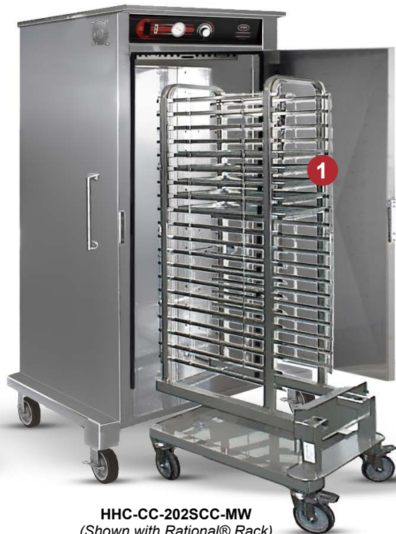
HHC-CC-202SCC-MW (Shown with Rational® Rack)